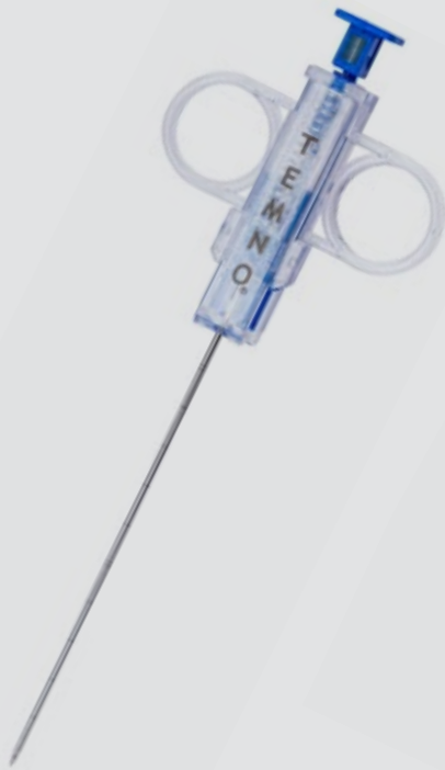
Adjustable Coaxial Temno®